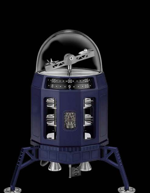
74.6008/204 JET TO SPACESHIP