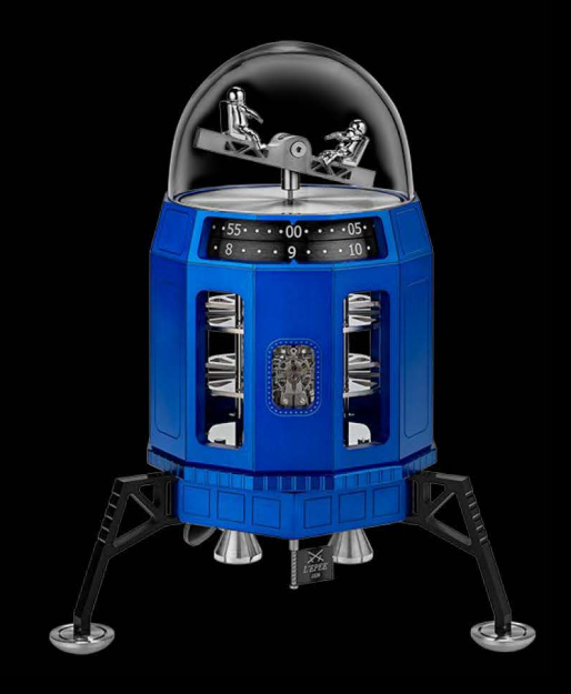
74.6008/404 HUMAN TO HUMAN